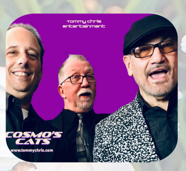
May 10 COSMO'S CATS