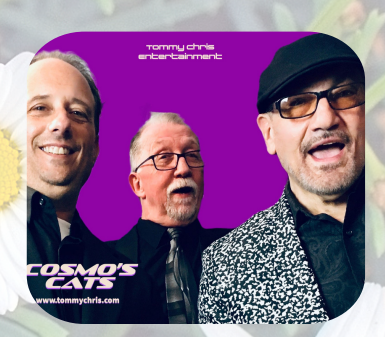
May 25 COSMO'S CATS Memorial Day Weekend Gelebration