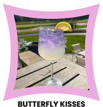
BUTTERFLY KISSES Lavender lemonade to kick off the beautiful spring season!