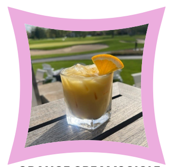
ORANGE CREAMSCICLE This cocktail will take you back to the good old days with a fresh citrus finish!