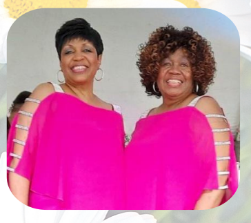
May 24 TIMELESS CLASSIX Memorial Day Weekend Gelebration