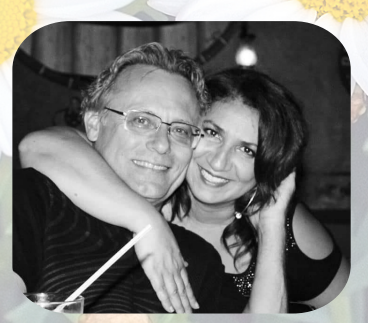
May 11 VEGAS BAND