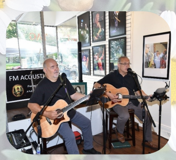
May 18 FM ACOUSTIC