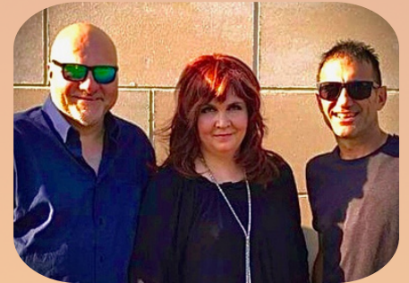
April 27 DEAD FLOWERS