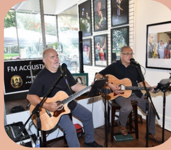
April 19 FM ACOUSTIC