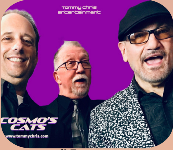
April 5 COSMO'S CATS